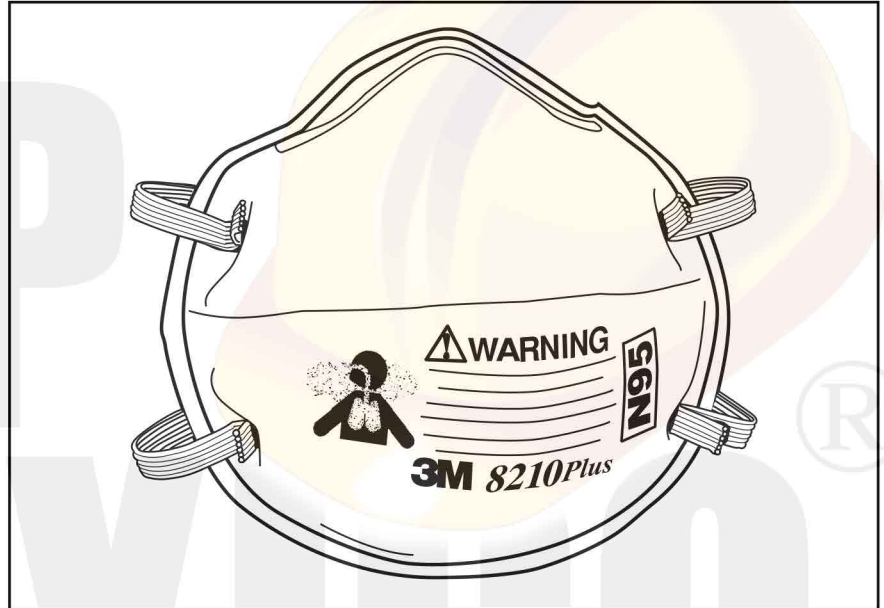
3M™ Particulate Respirator 8210Plus, N95

3M's disposable respirators are designed to help provide quality, reliable worker protection that meets the varied needs of our customers who rely on consistent product performance and service. 3M's proprietary filter media and superior product construction help provide greater worker comfort which can help increase productivity.